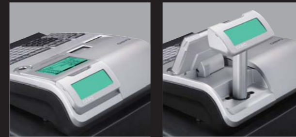
Large popup display

Character display and pop-up capability ensure easy readability for customers. Mistake-free register operation fosters customer trust and increases shop credibility.