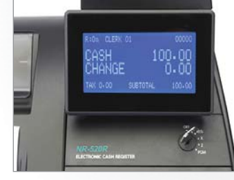
• 8 Line Blue Backlit, Graphic Liquid Crystal Display.

2 x Serial Ports & 1 x Type A & 1 x Type B USB Port provide connection to various devices including; Kitchen Printer, Bar Code Scanner, Computer, Scales. Remote Pole Display.