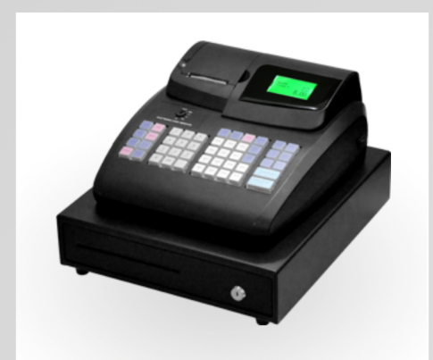
MODEL 8 COMPACT CASH DRAWER