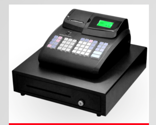
MODEL 9 STANDARD CASH DRAWER

Simple to use and operate with customisable description for receipt & department names.