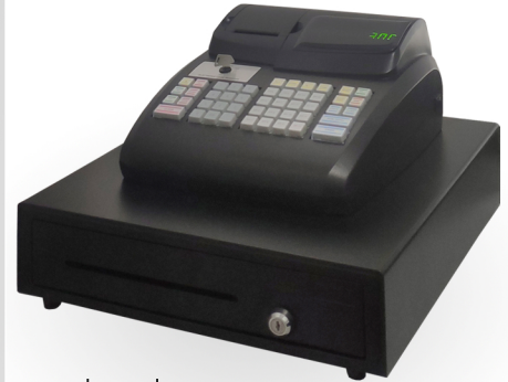
Lorem Ipsum MODEL 3 STANDARD CASH DRAWER

Simple to use and operate with pre-set fixed receipt & department names.