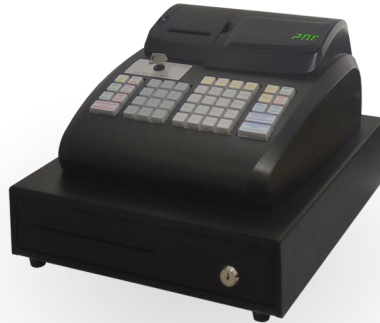
MODEL 2 COMPACT CASH DRAWER