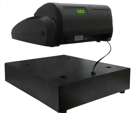
DETACHABLE CASH DRAWER