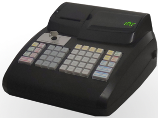
MODEL 1 NO CASH DRAWER

Works straight from the box without the need for any complicated programming