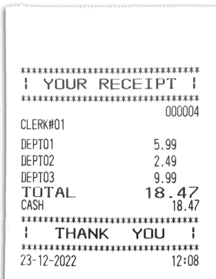
SAMPLE FIXED SALES RECEIPT