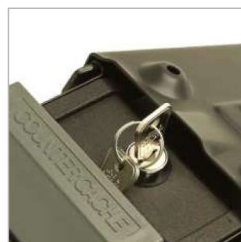
Secure locking system