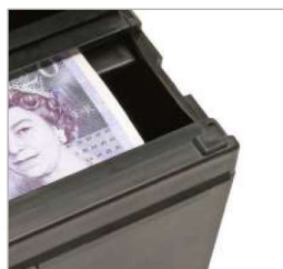
Perfect note presentation