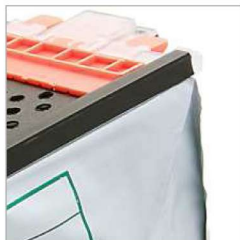
Tamper evident pouch