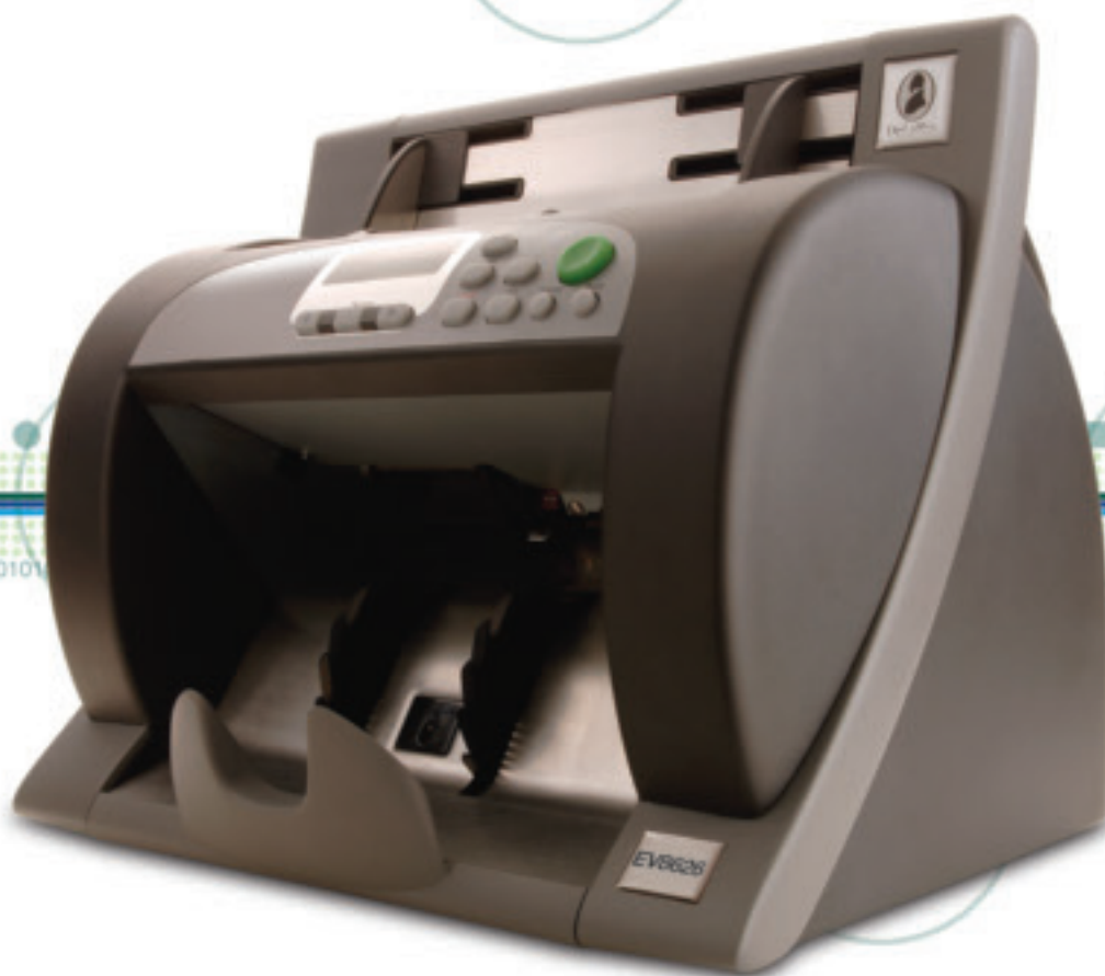
EV8626 Currency counting machine